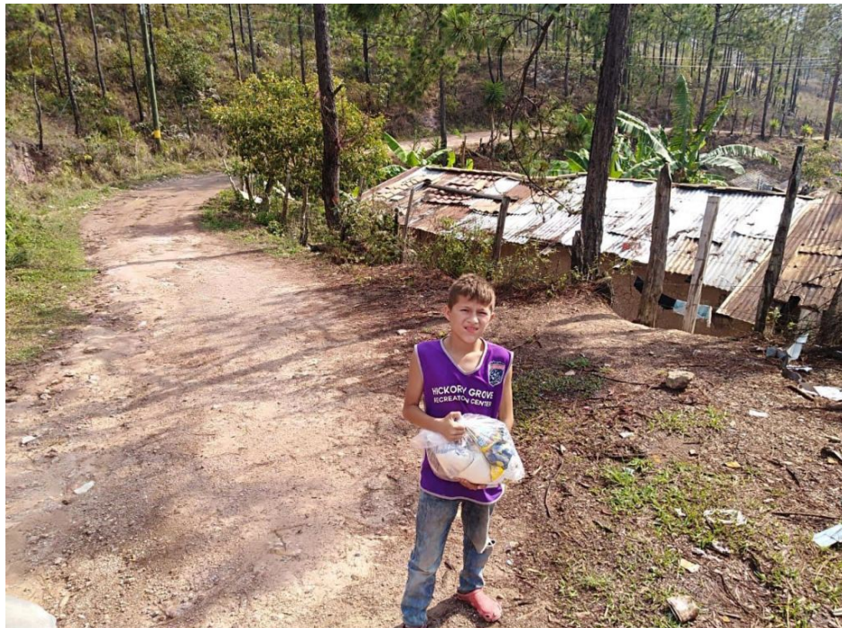
- A WELCOME EMERGENCY FOOD BAG -