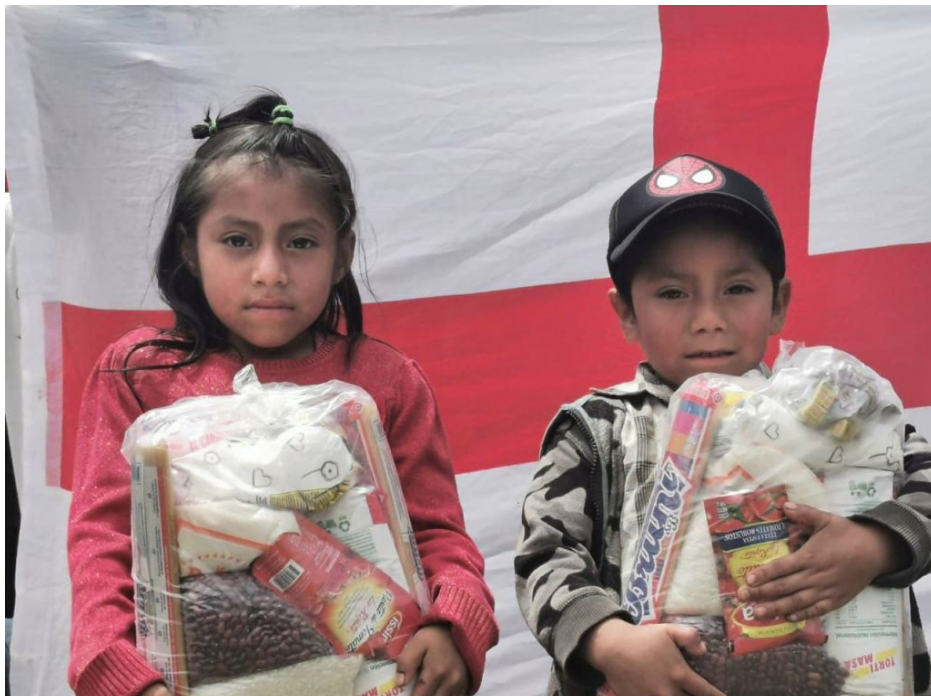
- LENCA CHILDREN RECEIVING FOOD BAGS -