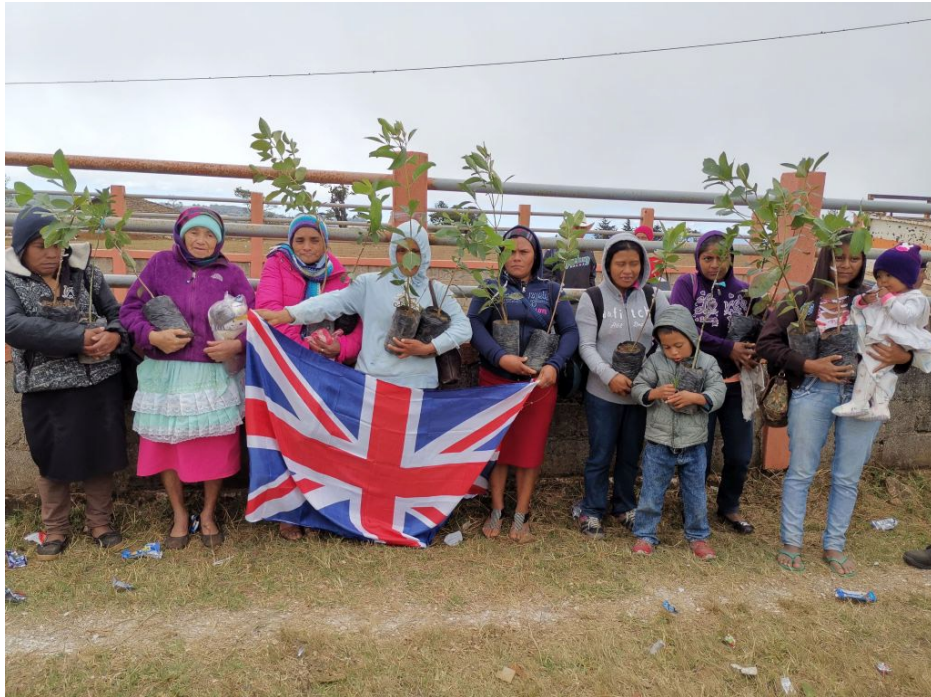
- SOME OF THE LENCA RECEIVING TREES -