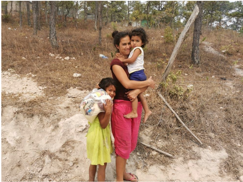
- MOTHER AND CHILDREN RECEIVING A FOOD BAG -