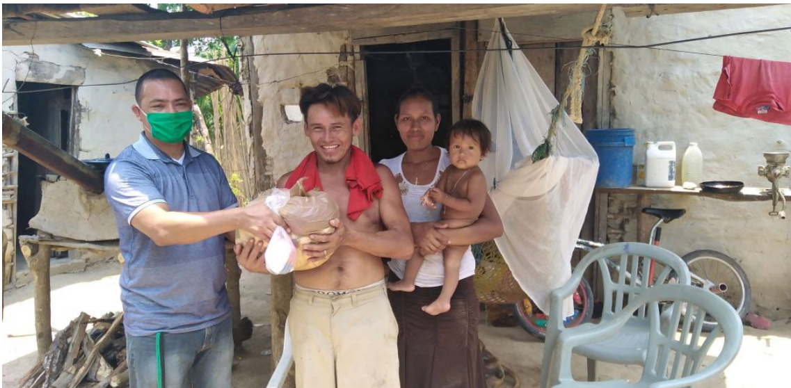
- JERONIMO DISTRIBUTING FOOD BAGS -