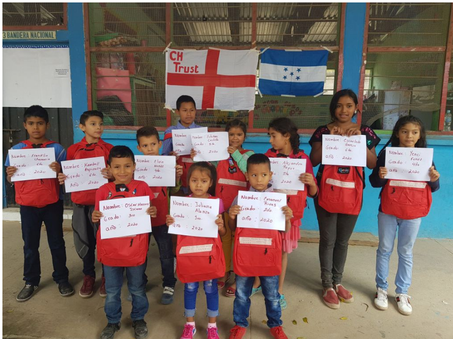
- SPONSORED CHILDREN WITH RUCKSACKS CONTAINING SCHOOL ESSENTIALS -