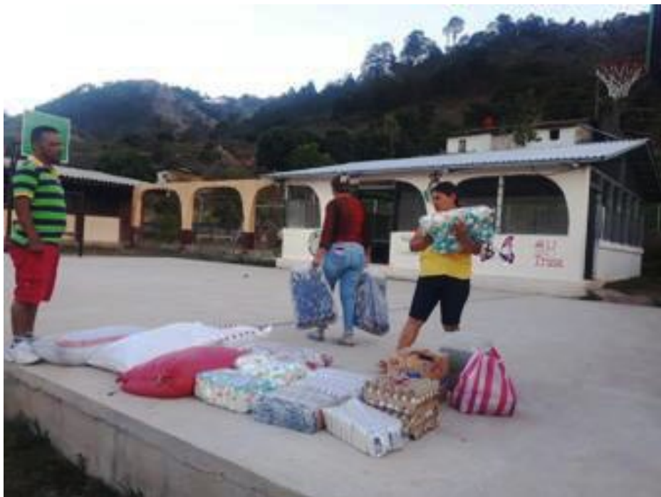
- OUR FOOD DELIVERY AT SABANETA SCHOOL -