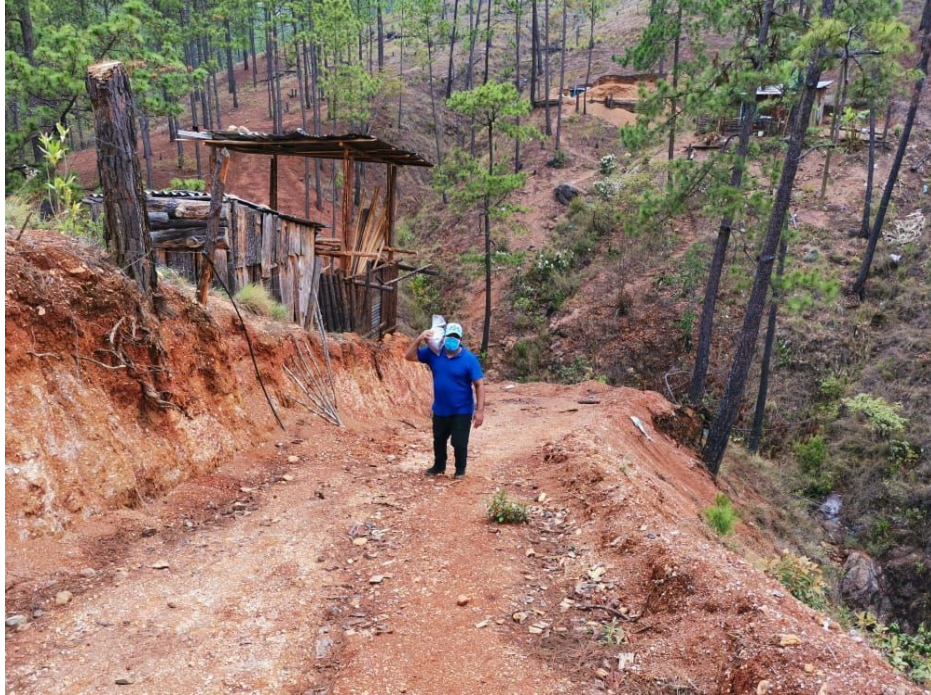
- DELIVERING FOOD BAGS TO OUT OF THE WAY LOCATIONS -