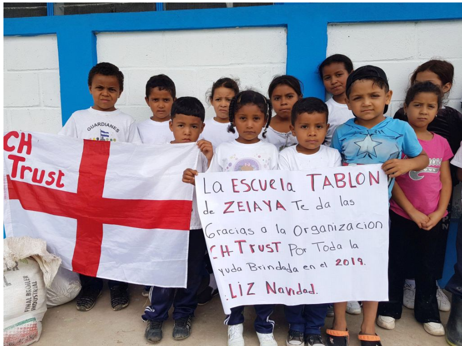
- SPONSORED CHILDREN AT TABLON SCHOOL -