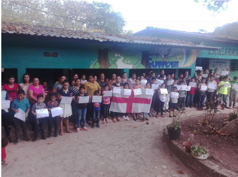
- SPONSORED CHILDREN AT GUANACASTE -