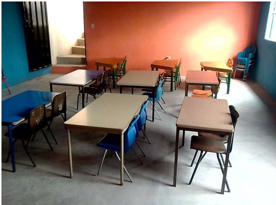
- INSIDE THE NEW KINDER -