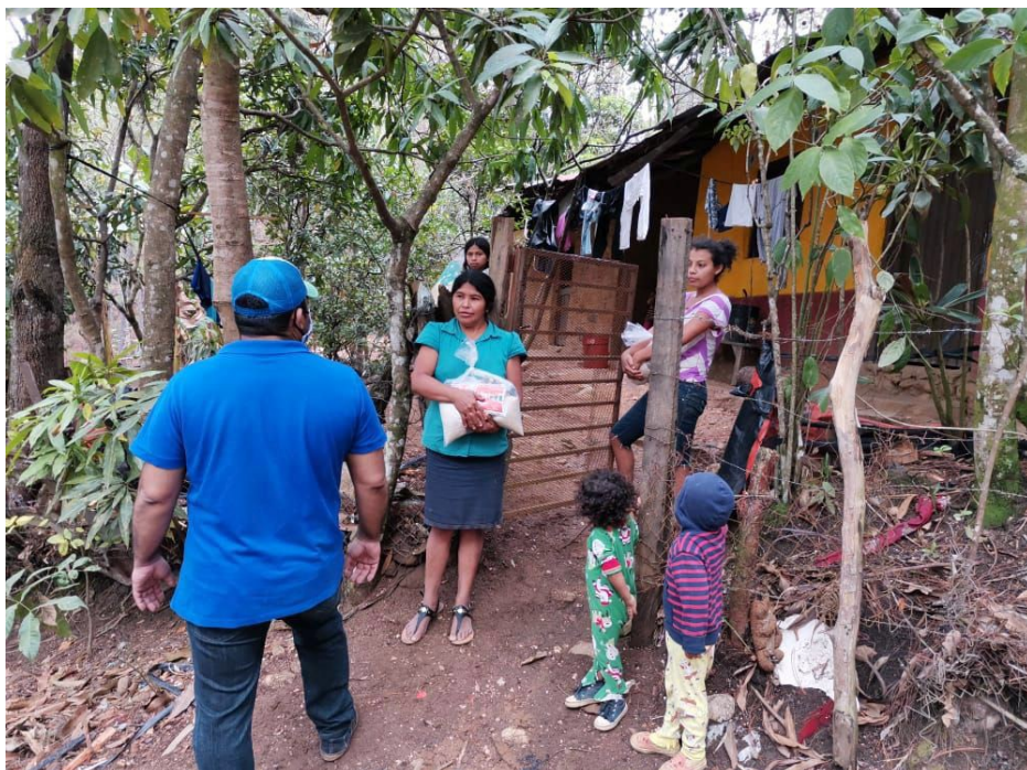
- RECEIVING MUCH NEEDED FOOD -