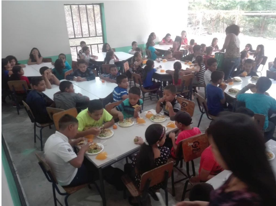
- CHILDREN EATING IN MARY'S DINING ROOM -

Macuelizo is now waiting their turn for a dining room but this I believe to be a complete new build and therefore more expensive.