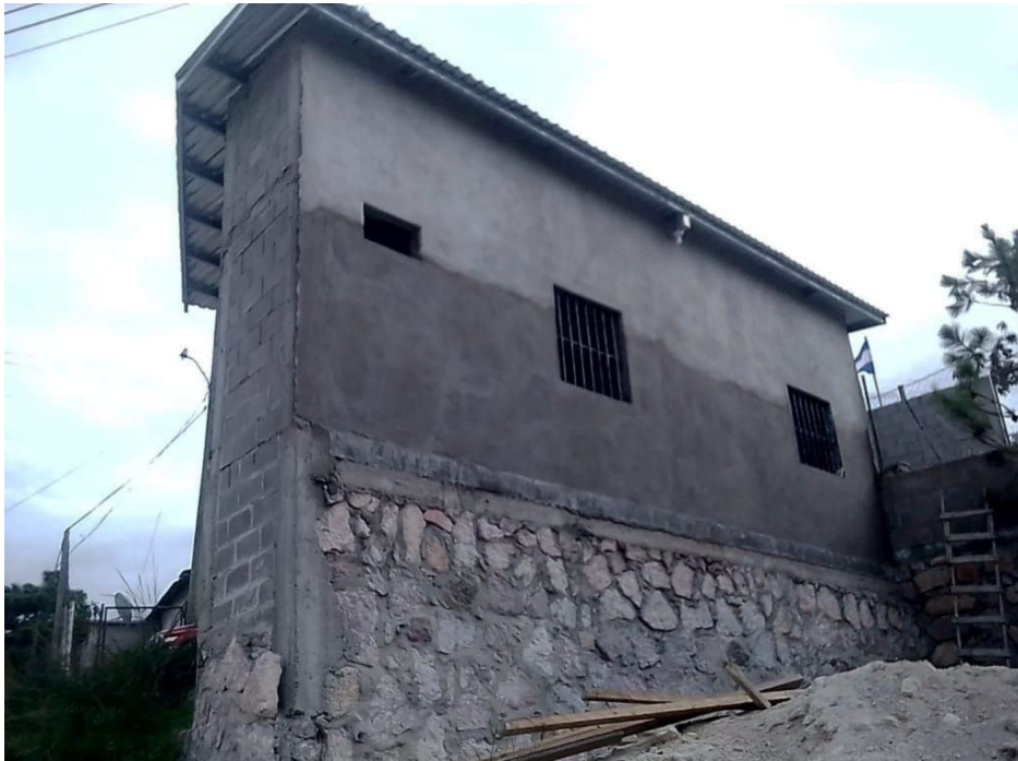
- THE NEW KINDER BUILDING -