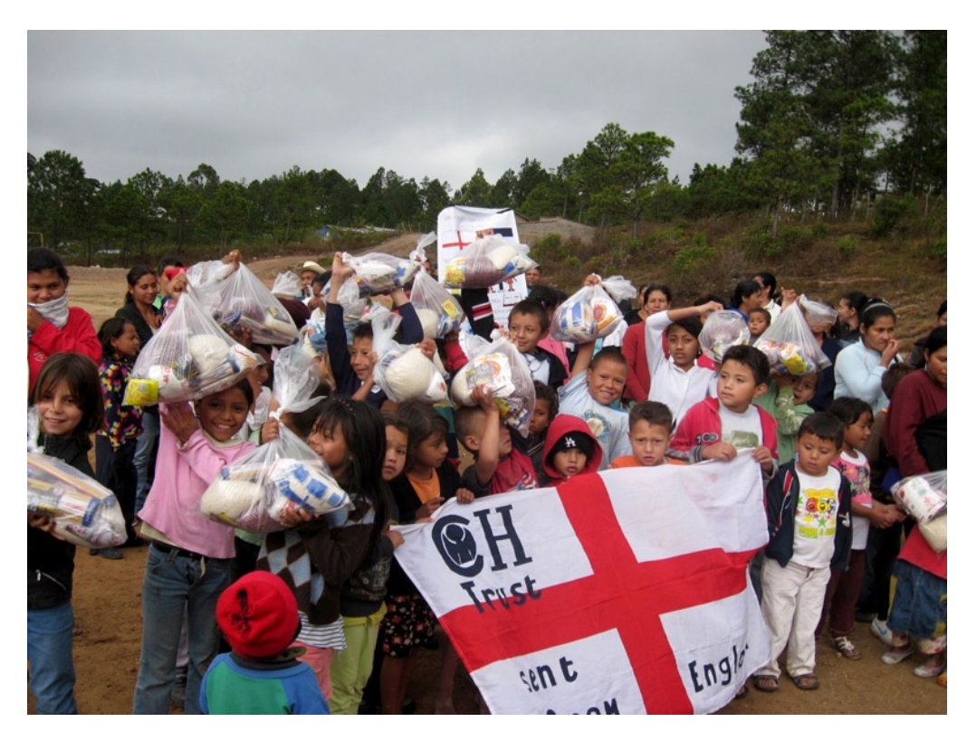
- A Lenca Community Receiving Food and Clothes -