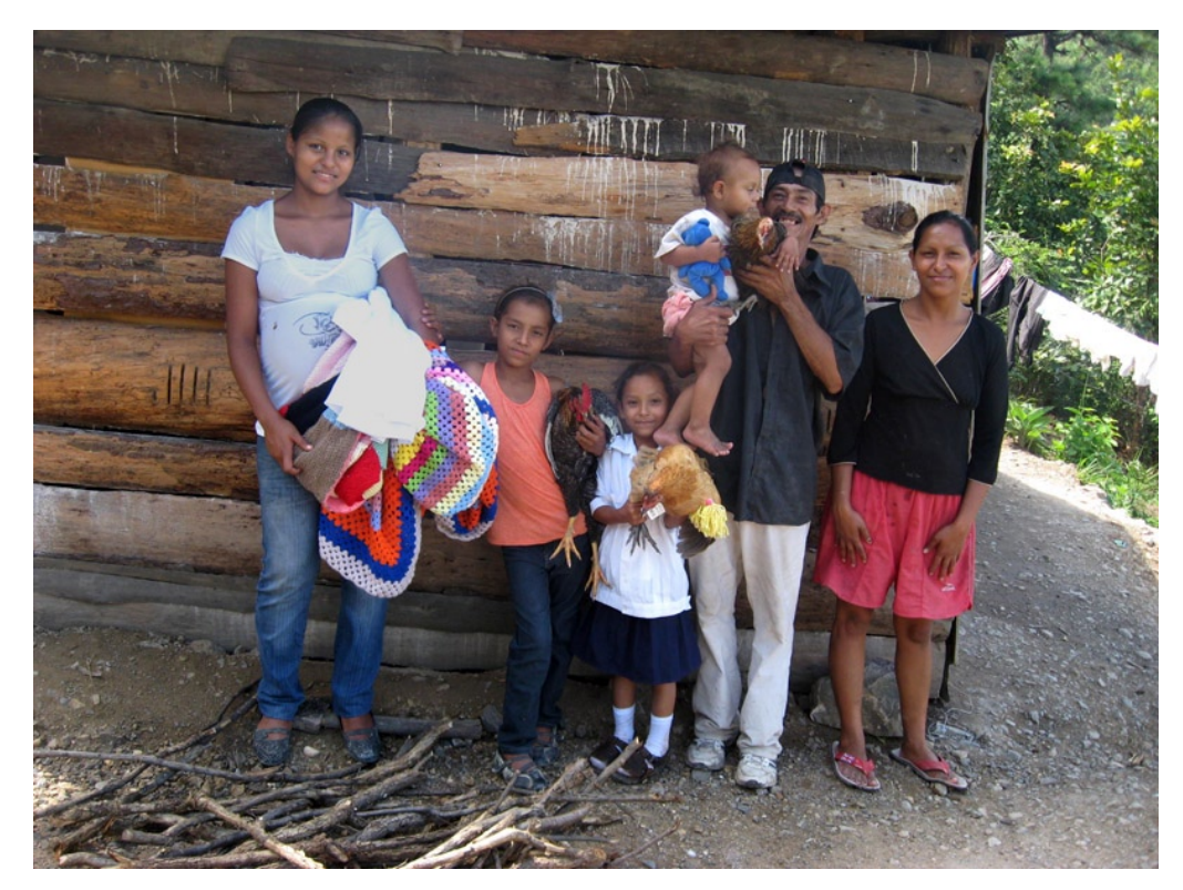
- CHICKENS AND GIFTS FROM ENGLAND -