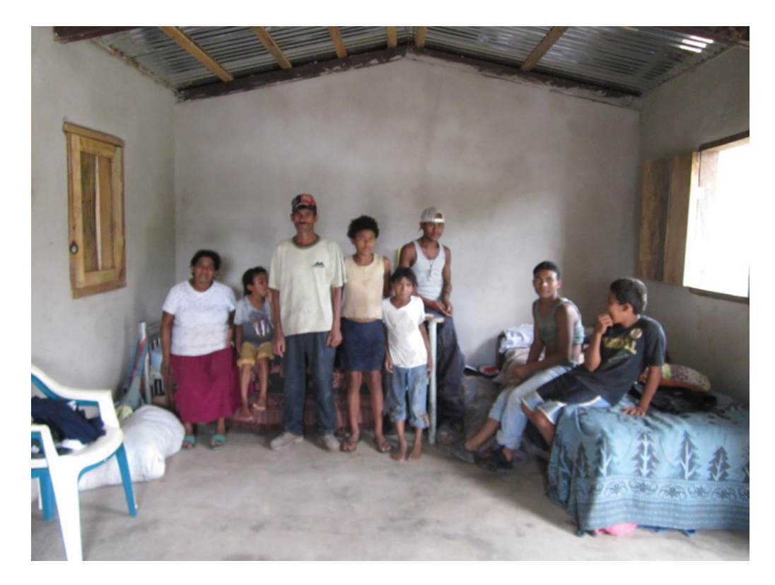
- THE FAMILY INSIDE THE NEW PLASTIC HOUSE -

I feel so happy that after such a difficult life in great poverty, I have received the best thing in my life. A dream becomes reality, my house. Thanks be to God, you have given great happiness to me and my 12 children, with whom I spent many years begging for help from house to house. Sometimes people refused me their help and then I had to sleep in the parks or in abandoned houses until at last we managed to build a house of plastic and cardboard. I took my children and my husband there and we have lived there for more than 8 years until God and you came into my life, when I most needed it. Because I never thought I would have a lovely house with a proper roof, where I will never get wet anymore and where my children will not suffer from the cold. Thank you for giving me this gift. I feel that this house has made an incredible change to our lives. I know that many people wonder at this change, because I lived a life of almost extreme poverty and now I live a decent life. I haven't the words to say how I love you and may the Lord our God bless you."