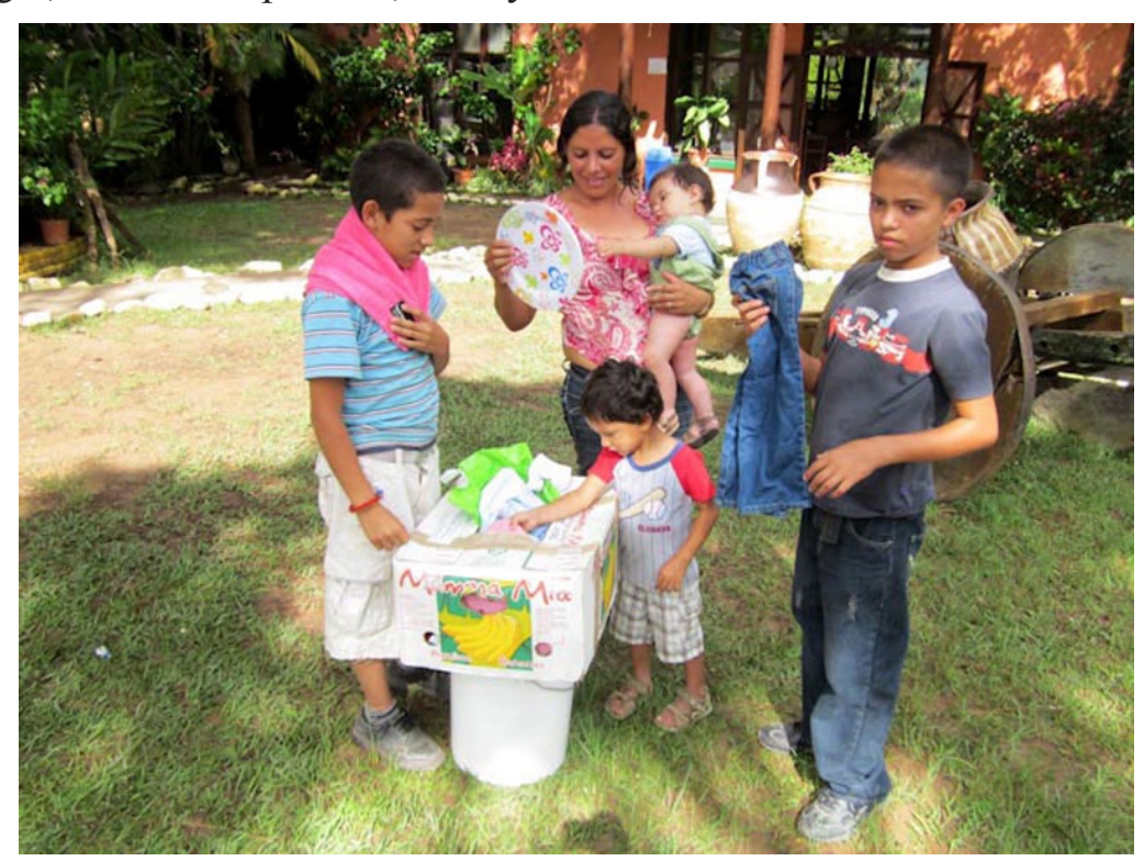
- Family in Crisis Unpack Their Box -

To support the families in crisis project, we are looking for metal cutlery, towels, plastic washing lines, plastic plates and beakers, soap, toothpaste, brushes and combs, children's pants and socks, torches, and basic food items such as pasta, rice, sugar, dried milk powder, family size tins of tomatoes and stock cubes.