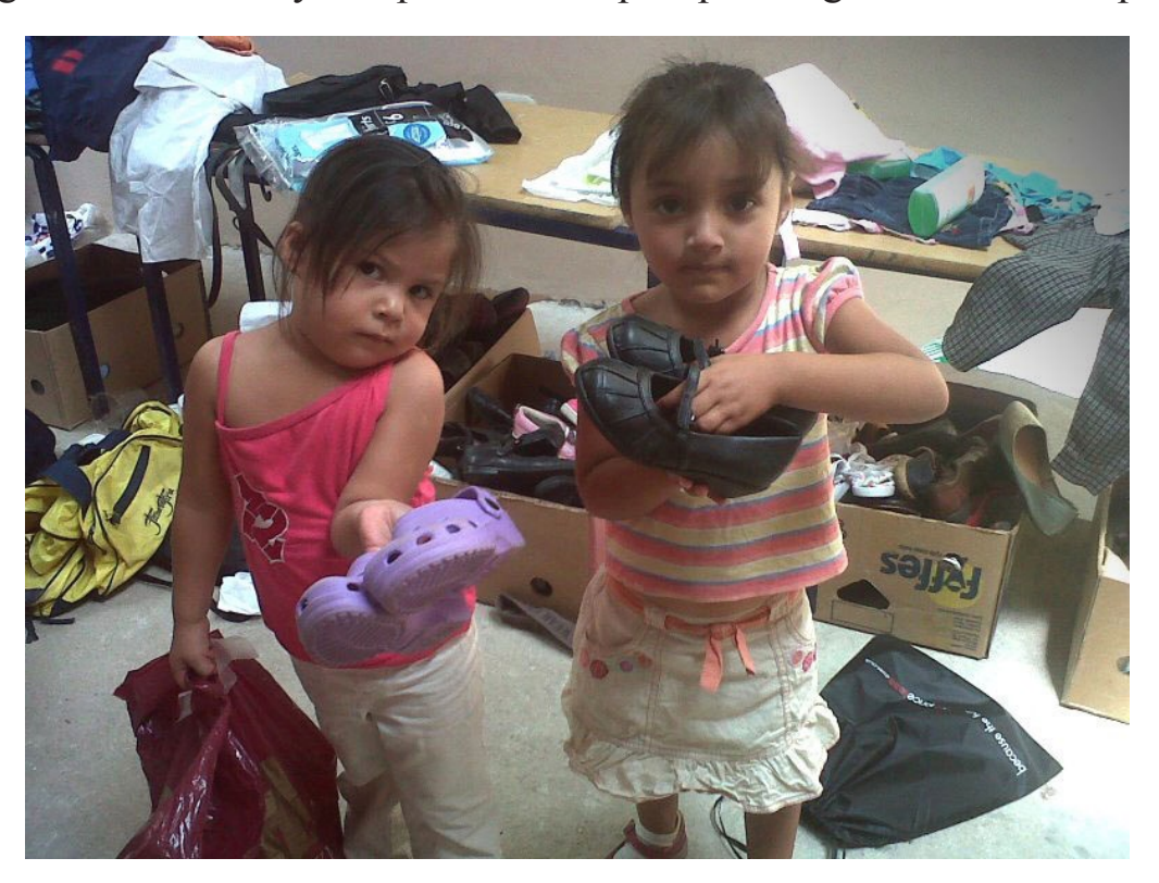
- WE HAVE FOUND SHOES -

Loading day proved to be an excellent event in every respect. We were blessed with a fine day, which was warm and sunny after the morning fog had cleared. Loading was successfully completed in a super spirit of goodwill and cooperation,