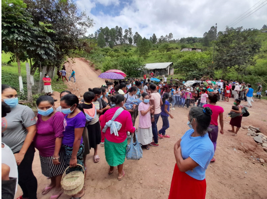
- TOLUPAN PEOPLE QUEUING FOR FOOD BAGS -

In common with the rest of the world, the price of basic grains, upon which the poor survive, has risen sharply. Honduras has to buy food on a world market affected by imbalance of supply and demand and increasing fuel prices. Where Cesar buys our food for the food bags, the school kitchens and the feeding centres, the proprietor, Rossy, does all she can to cut her profit margin. She regards CH Trust as a good loyal customer, and she likes what we are doing with the food.