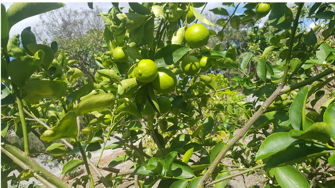
- A GOOD CROP OF LEMONS -

I received this photo two weeks ago. It is one of our fruit trees, which was planted some years ago in Vicente College grounds. As you can see, it is loaded with fruit. They will eat the mangos and make lemonade with the large sweet juicy lemons. Other trees will fruit later. Peach trees are very popular, as they have a long fruiting season rather than all the fruit cropping at once, like banana trees.