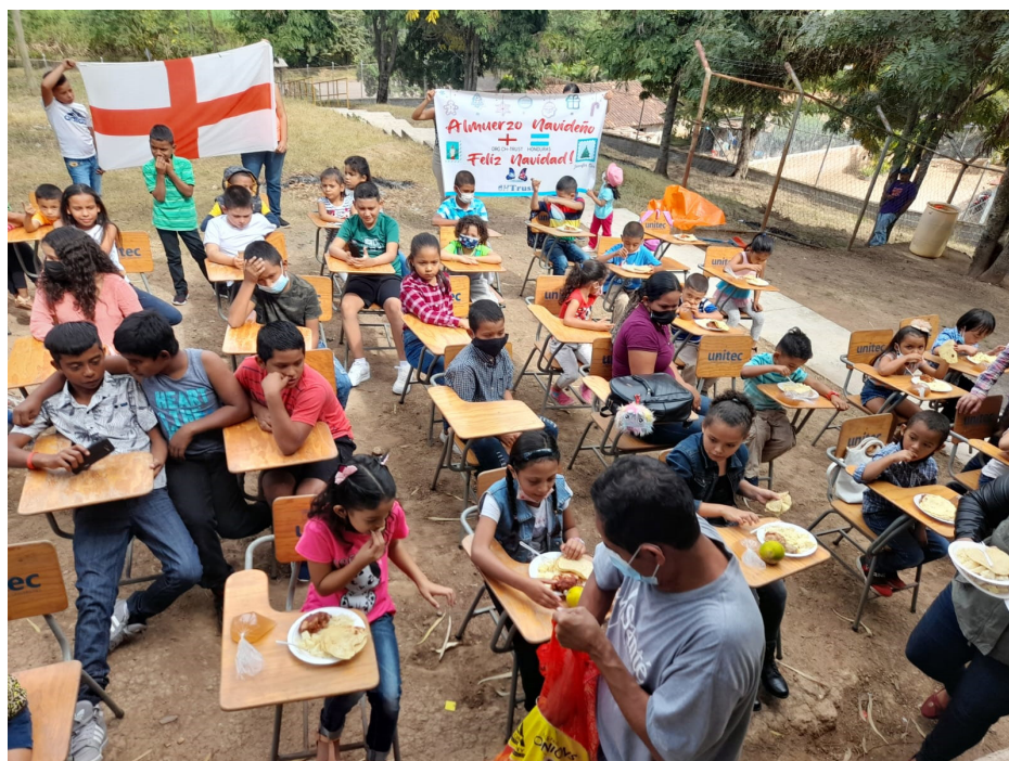
- CHILDREN ENJOYING A CHRISTMAS PARTY -

This extra special meal included chicken and a piece of fruit. For most of the children chicken is only for very special occasions and something that few people have eaten during the last two years.