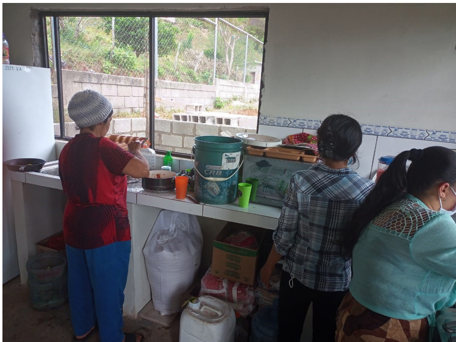
- THE BUENA VISTA KITCHEN. THE NEW EXTENSION CAN BE SEEN TAKING SHAPE THROUGH THE WINDOW -

Hello Jenn, yesterday it was a little late to be able to give you this very good news. The team of mothers are collaborating to make the proper functioning of this dining room possible. It was a surprise for me when I went to organize the starting of classes for a new school year. The ladies had worked to buy a second-hand stove and refrigerator that today is very useful in this beautiful dining room. Meanwhile, the fathers have been making an extension that will be used to store the food supply, which is allocated on a daily basis to be cooked. The men are planning the construction of an ecological stove to cook tortillas, rice, beans, corn. This is more economical on wood, and better on smoke control.