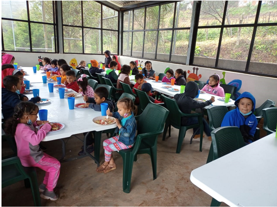
- CHILDREN ENJOYING THEIR CHRISTMAS PARTY IN THE NEW BUENA VISTA DINING ROOM -