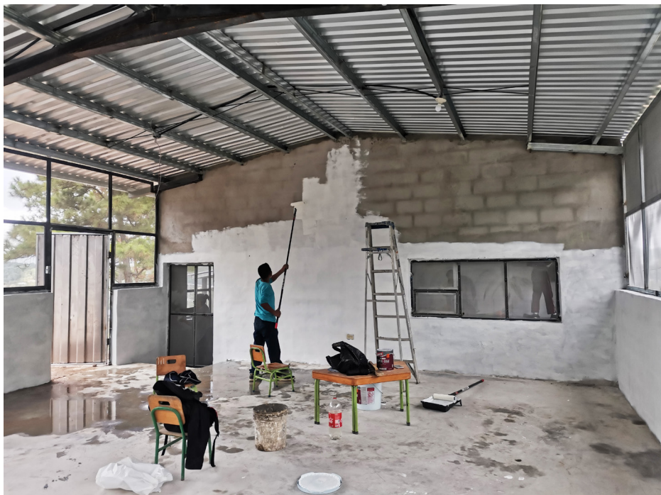
- THE NEW DINING ROOM AT MACUELIZO UNDER CONSTRUCTION -