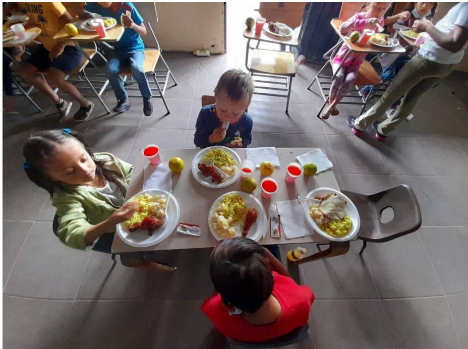
- A SPECIAL MEAL FOR HUNGARY CHILDREN -

Thankfully, last year, Honduras enjoyed a good harvest. After two years of poor or no harvest, many were able to eat beans and vegetables that they been able to grow. This year there has been some overnight rain during April, even though the rains proper do not start until May. Planting will start by the middle of May