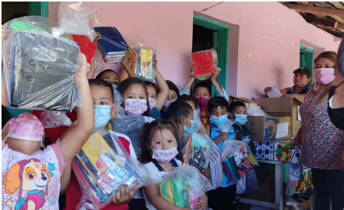
- STUDENTS RECEIVING THEIR SCHOOL SUPPLIES -