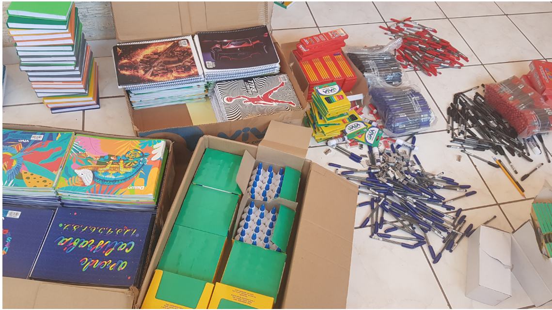
- ESSENTIAL SUPPLIES REQUIRED TO ATTEND SCHOOL -