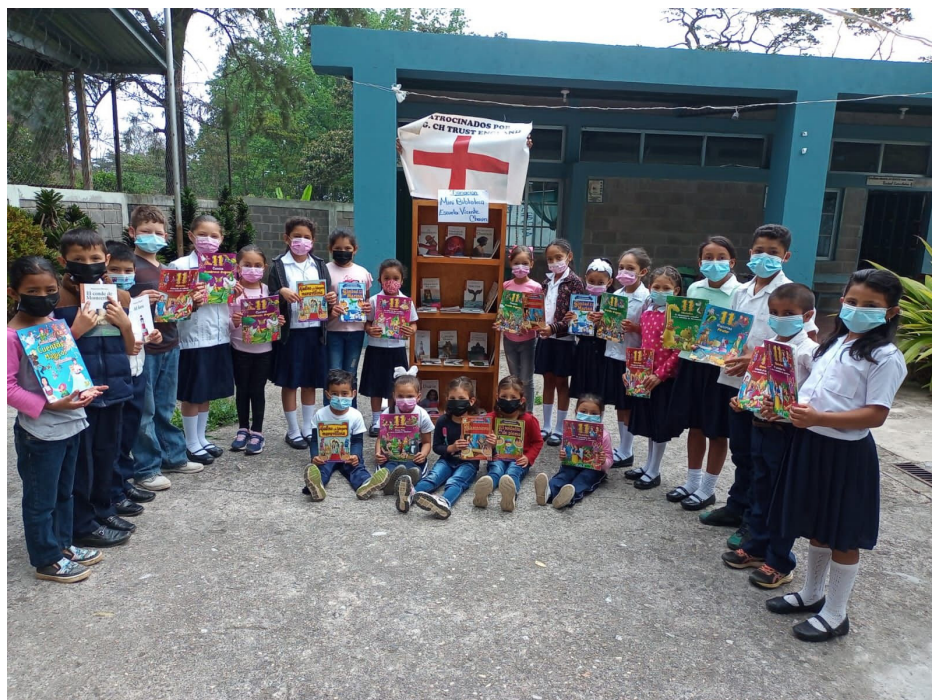
- ANOTHER SCHOOL PROVIDED WITH A MINI LIBRARY -