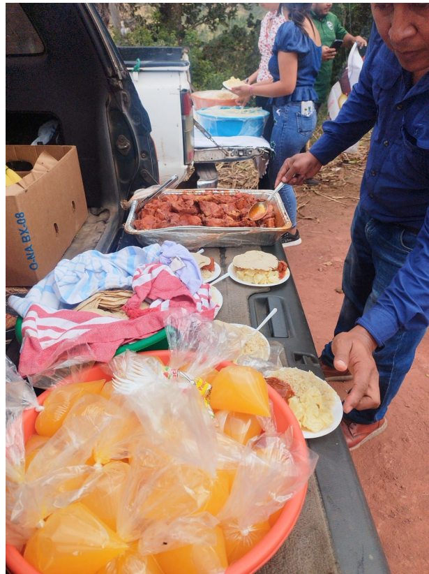
- ENJOYING AN OPEN AIR DINNER -