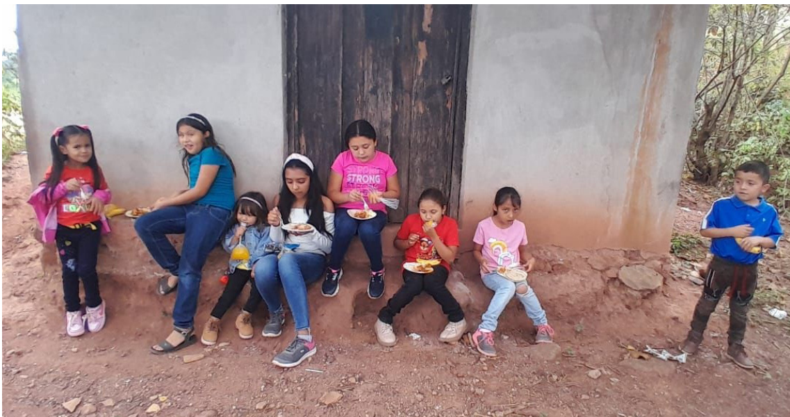
- FINDING A SPOT WITH FRIENDS -