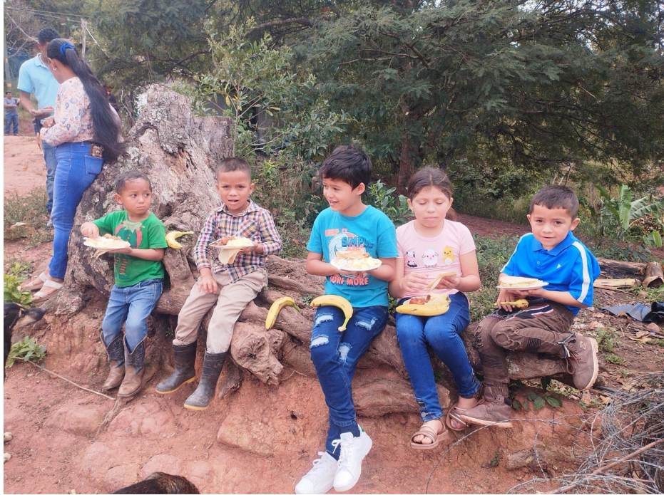
- CHILDREN ENJOYING THEIR CHRISTMAS DINNER -