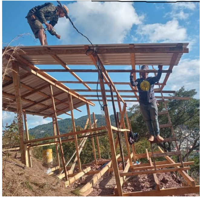
- TWO HUNDRED AND FIFTY STEPS TO THE NEW WOOD HOUSE BUILD -