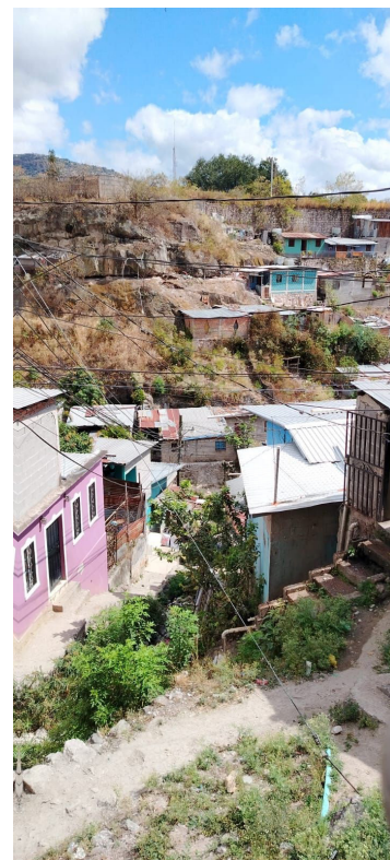
- THE HALF BUILD HOUSE -