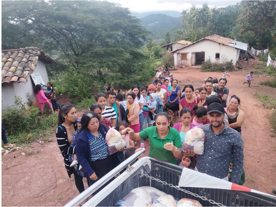
- PROVIDING AID TO THOSE AFFECTED BY THE FLOOD -