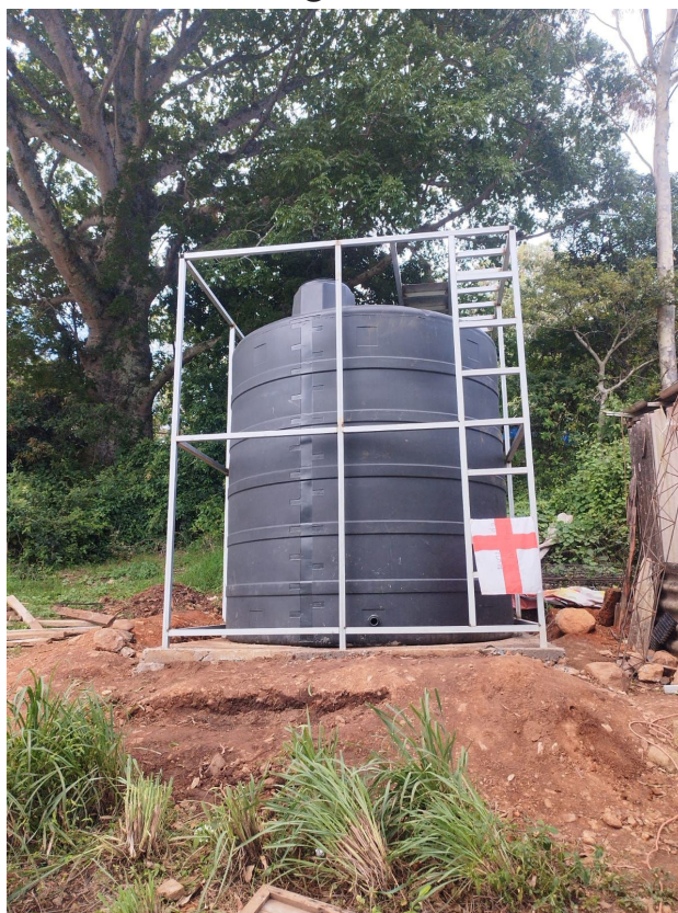
- THE MUCH NEEDED BLACK TANK IN PLACE -

In the last newsletter you saw the base being prepared for a water tank that we were buying for Hector Medina College.