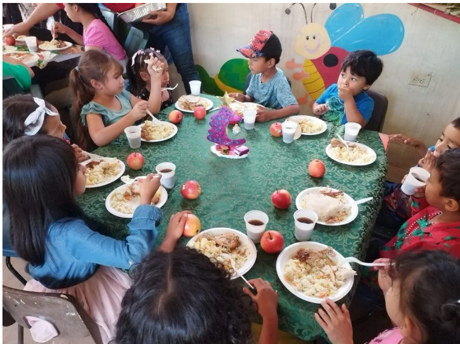
- TERM ENDS WITH CHRISTMAS DINNER -

Here is a selection of the photos from the various schools we supply: