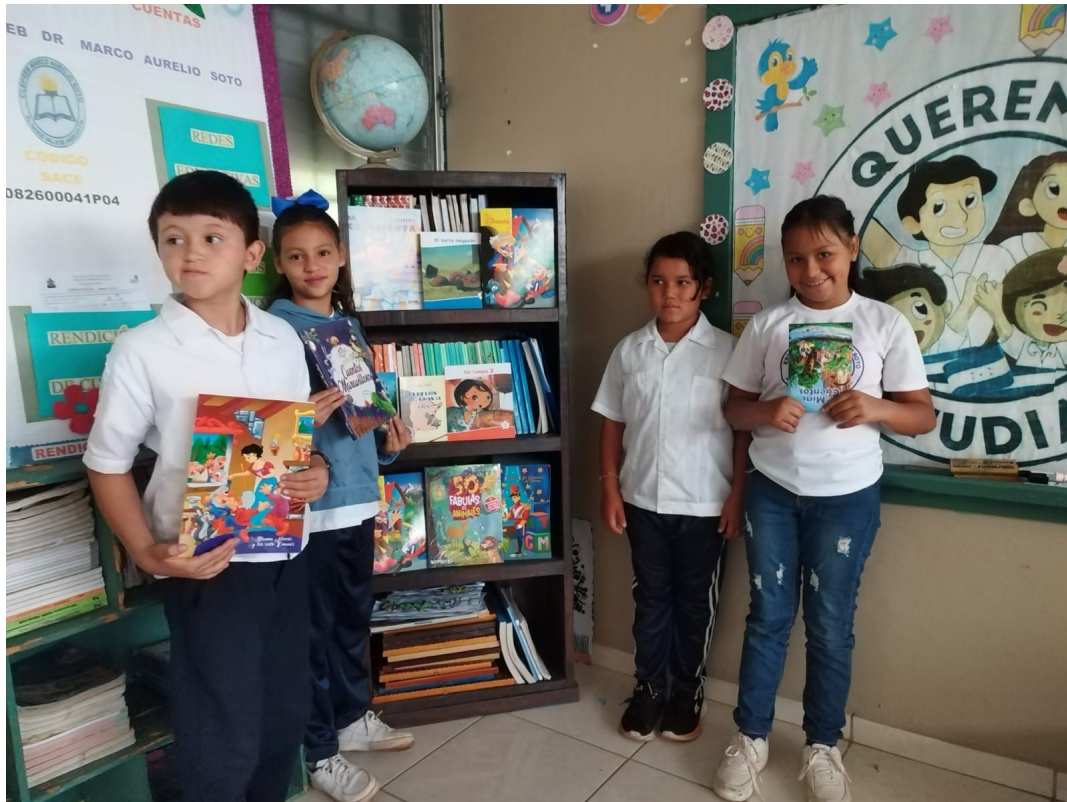
- OUR NEW SCHOOL MINI LIBRARY -