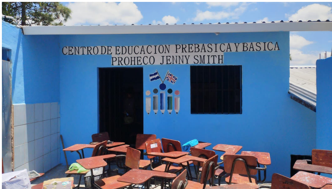
- A NEW COLOUR SCHEME -