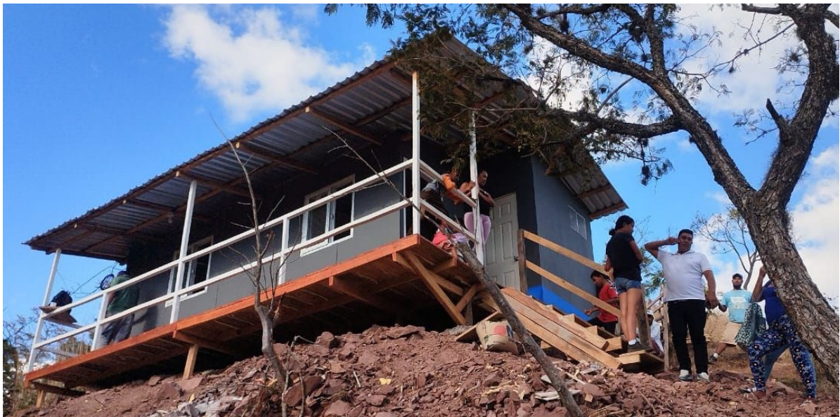
- THE COMPLETED HOUSE HIGH IN THE MOUNTAINS -