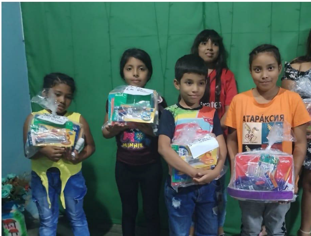
- RECEIVING SCHOOL SPONSORSHIP KITS -